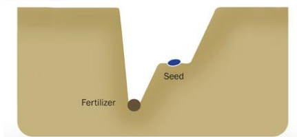
dw™ SCRAPER Soil Profile

Of course you do .... And with the unique Disk Wing™ (dw™) Scraper exclusively from Bourgault you can. When fitted with a dual shoot distribution system and dw™ scrapers, starter fertiliser is directed to the bottom of the furrow while the seed is directed to a soil shelf created by the opener to the side of the coulters furrow.